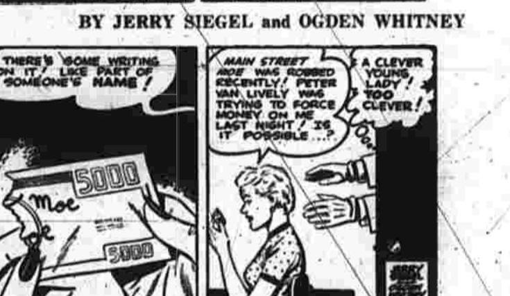
BY JERRY SIEGEL AND OGDEN WHITNEY