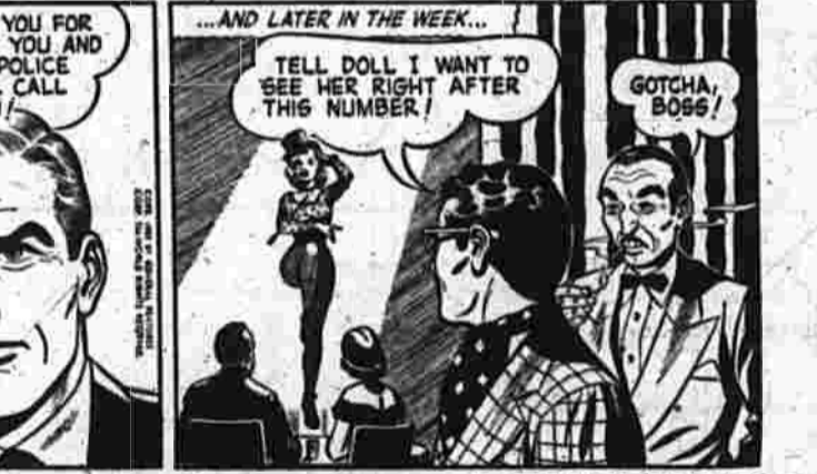
BY PETER HOFFMAN