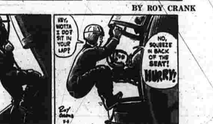
BY ROY CRANK